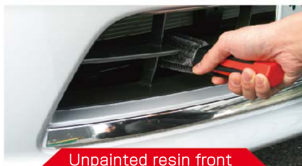
Unpainted resin front