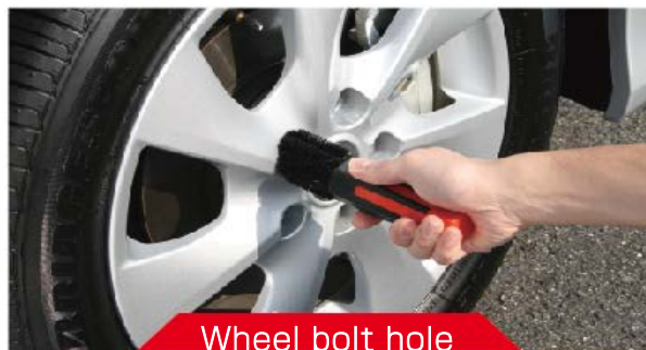
Wheel bolt hole

Easily cleans parts which was hard to wash!