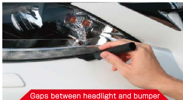
Gaps between headlight and bumper